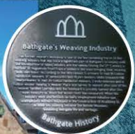
Bathgate's Weaving Industry Plaque #11

There is significant local interest in Bathgate's rich history which can be traced back to 1160.