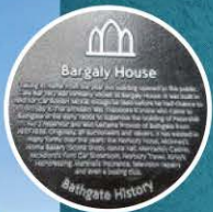
Bargaly House Plaque #9