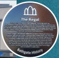
The Regal Plaque #10